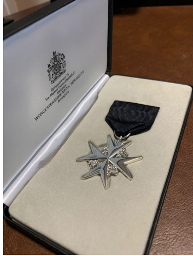
Insignia Member of the Order of St. John

What an honour it was to be appointed to the grade of Member, of The Venerable Order of the Hospital of St. John of Jerusalem this year. The announcement came in the fall of 2020 and the presentation was to take place in June of 2021 at Queen's Park where the investiture normally takes