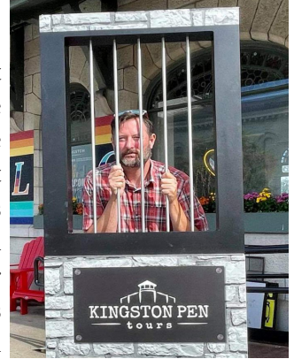
We toured the pen, kinda cozy

We learned this year that you can side 1/4 of your garage relatively well using YouTube and Rona delivery service. It will take a few weeks, but looks professional from a distance. A few trips to Windsor, one for Austin's birthday (10 months late), and a winery day on another (all but one were closed).