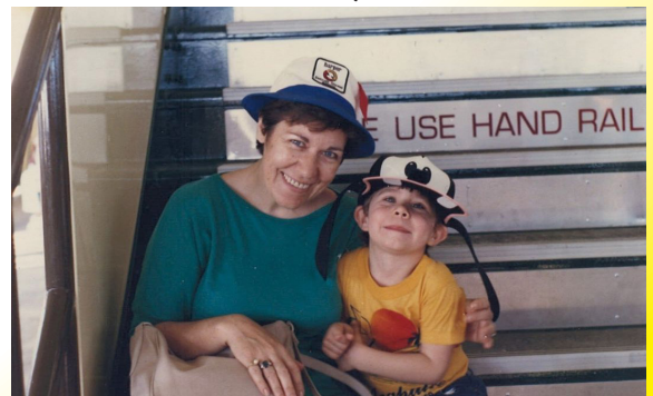
A day at disney no cares in the world.